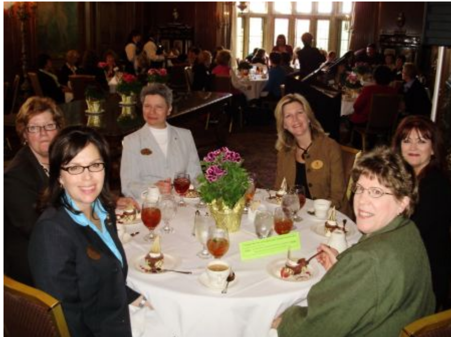
The Executive Assistants from Oakland University.